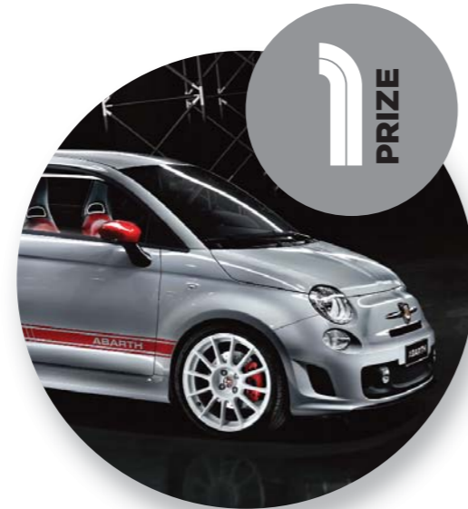
FIAT 500 ABARTH ESSE ESSE RACING CAR